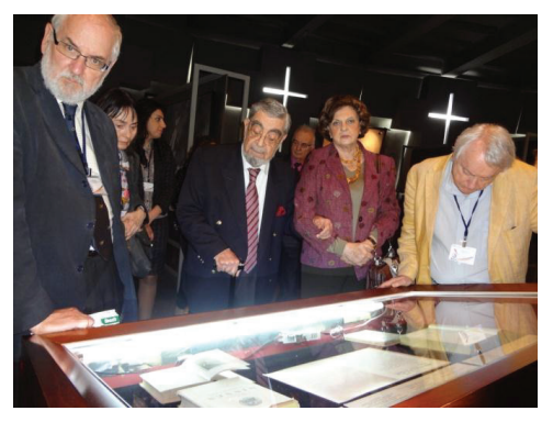
In the Armenian Genocide Museum-Institute (Yerevan, Armenia).