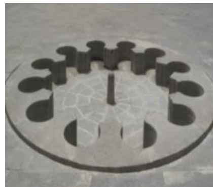
Figure 4. A new example of the fountain and boiling circle/spring of the tomb of Sheikh Safi al-Din Ardabili.

The boiling point of the spring has been placed carefully in the middle of the circle. The ma-