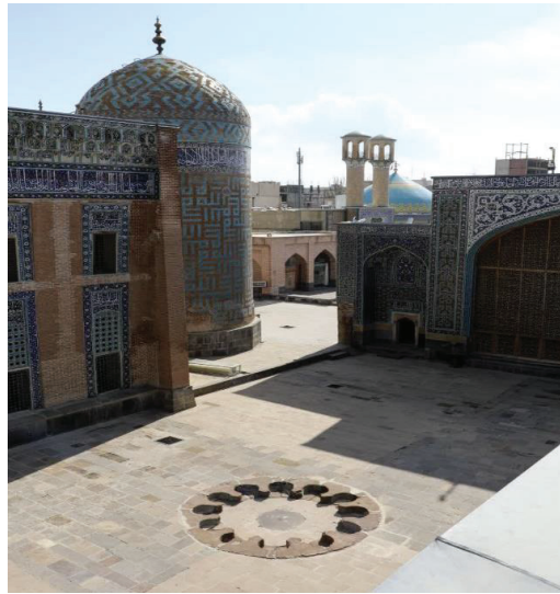
Figure 2. A boiling circle/spring in the tomb of Sheikh Safi al-Din Ardabili. These photos were taken by visiting the site in person and with the help of the cultural heritage expert of the collection (Mr Tohid Ghavām).

our architects use to convey philosophical and mystical concepts in a circular source.