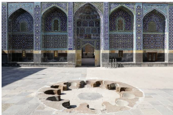
Figure 3. Another Figure of the boiling circle/spring in the tomb of Sheikh Safi al-Din Ardabili.

gure 2. and 3.). The reason for the connection between the symbol and its meaning is an extract from the significant theological, mystical, religious, and political-religious teachings of the Safavid period. The spring is located in the main courtyard, and recently, a new example of it has been prototyped near the main work (Figure 4.).