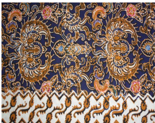
Figure 3. "Cuwiri" batik motive.

In the current competitive era, Laweyan batik producers must have competitive advancements to maintain and develop their business. Fortunately, there are organizational philosophies that are discovered, owned, and embraced by members of the Laweyan batik producers. These philosophies differentiate the Laweyan batik businesses from other organizations.