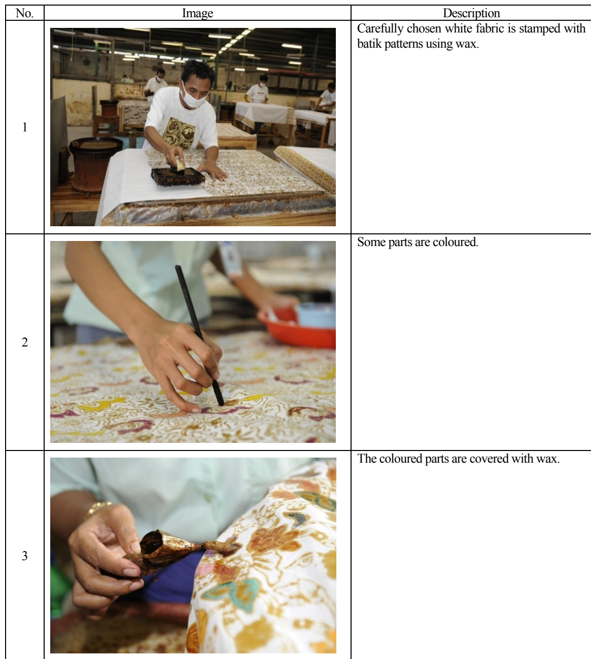
A Simplified Process of Creating Batik Fabric