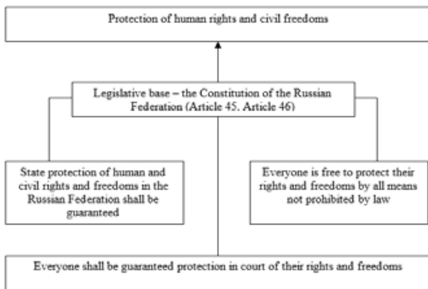
Figure 1. The Mechanism of Regulating Human Rights and Freedoms in the Russian Federation.

The implementation of human rights is a part of their protection since some conditions precede the corresponding implementation. In the Russian Federation, there are several burning issues, including the effective use of the Constitution of the Russian Federation for the state process, the implementation of its principles into real life and the definition of factors that negatively affect the implementation of constitutional norms (Fig. 1).